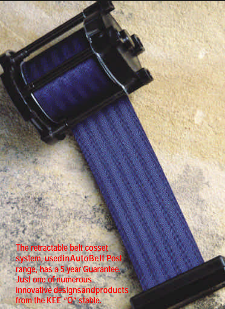
The retractable belt cosset system, used in AutoBelt Post range, has a 5 year Guarantee. Just one of numerous innovative designs and products from the KEE "Q" stable.